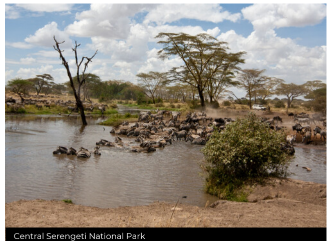
Central Serengeti National Park